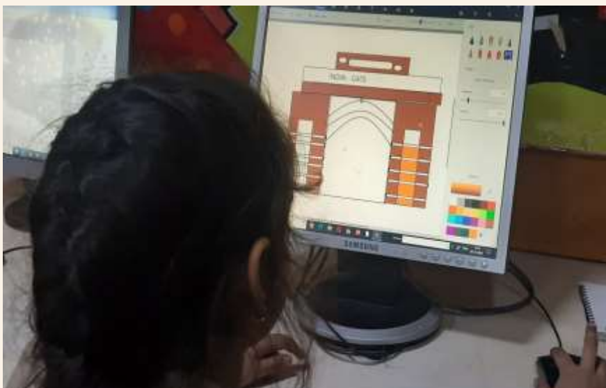
Fun with paint 3 D