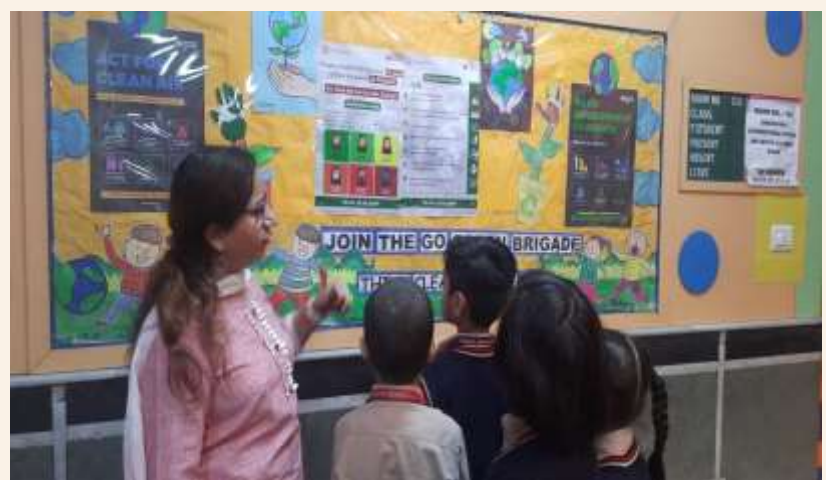
Act for Clear Air