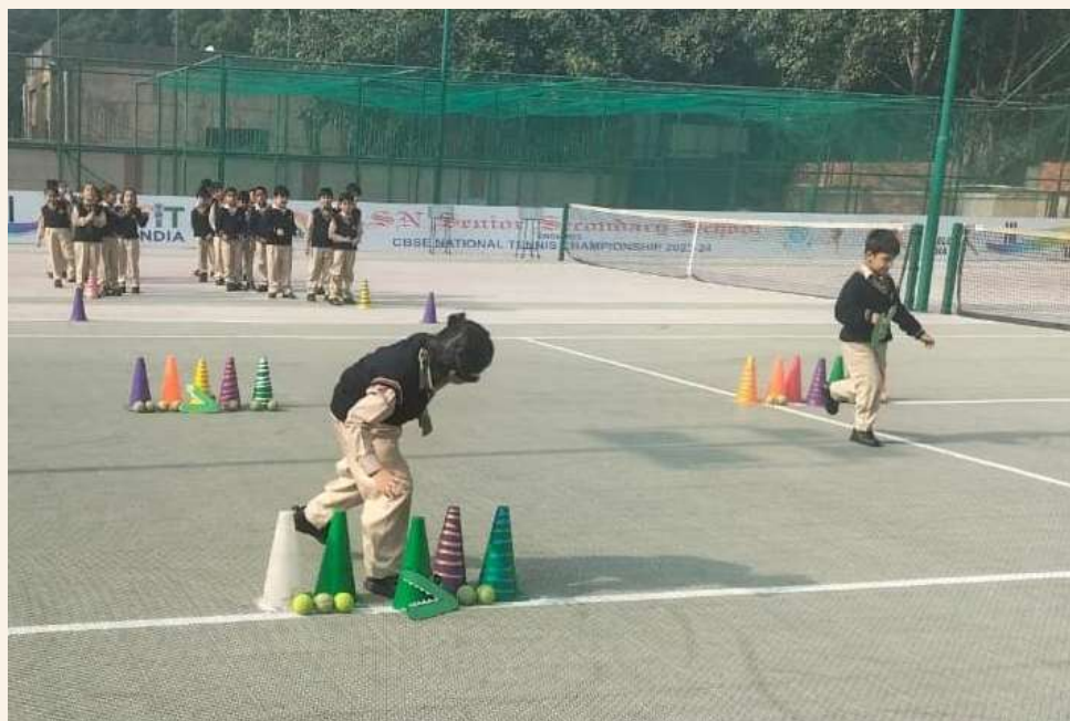
Sport Activity on Greater & Lesser