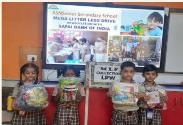
MLP Collection Drive