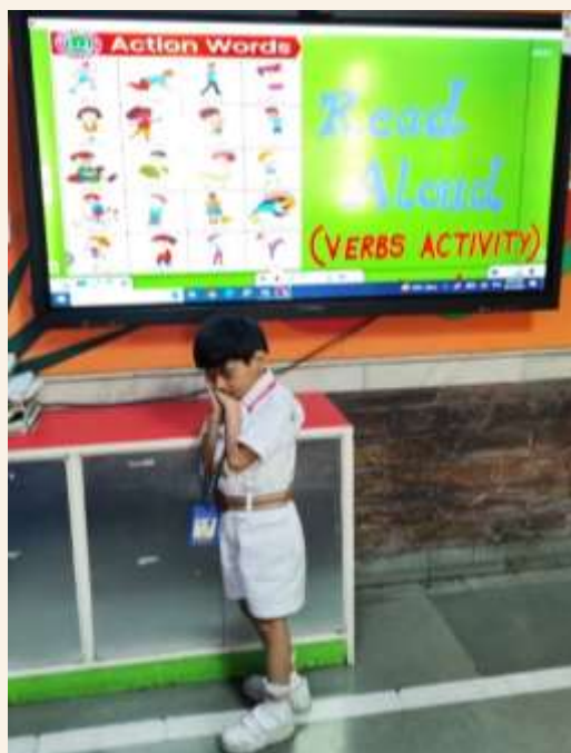
Verb Speaking Activity