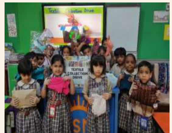
Textile Collection Drive