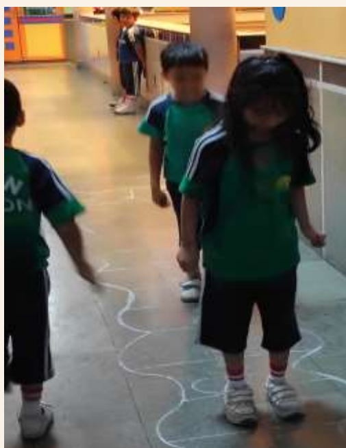
Skip Counting by 2's Ladder Floor Activity